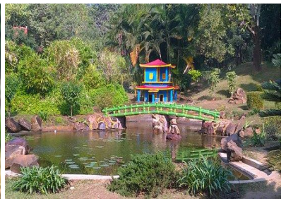
Day 2:- Bhubaneswar to Simplipal

After breakfast proceed to Simlipal, visit Khiching Temple. Overnight stay at Simlipal.